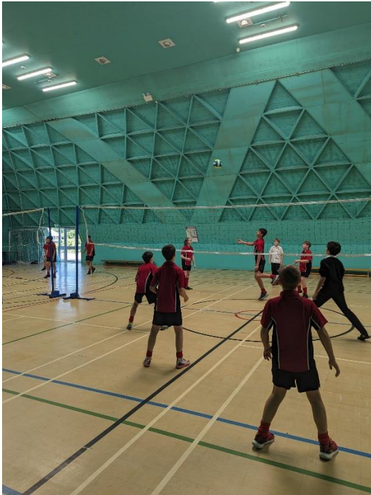
Volleyball Club Friday lunchtime in the Dome

Our extracurricular offer can be found on the school website HERE . Please sign your child up to the after-school events. This is not essential